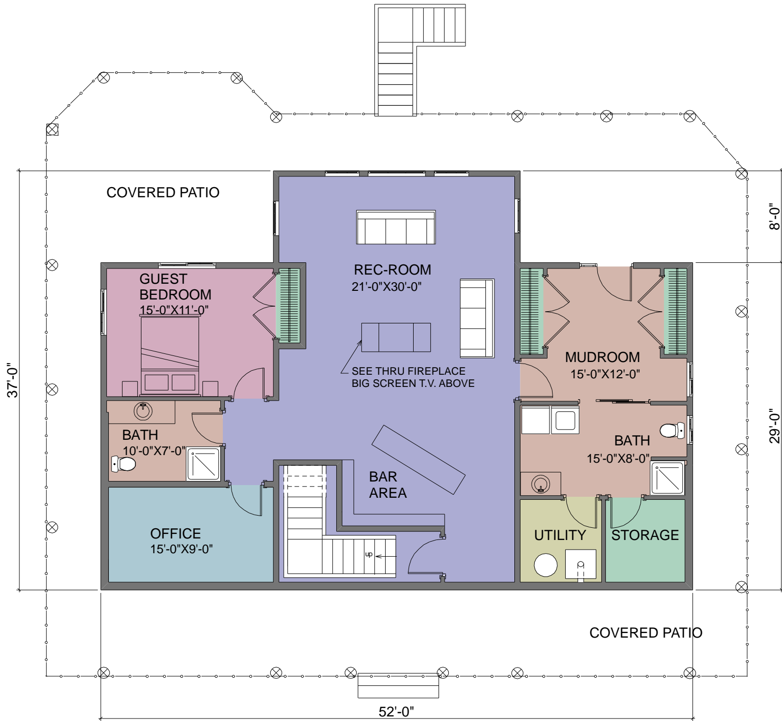
BASEMENT FLOOR PLAN AREA: 1640 SQ. FT.